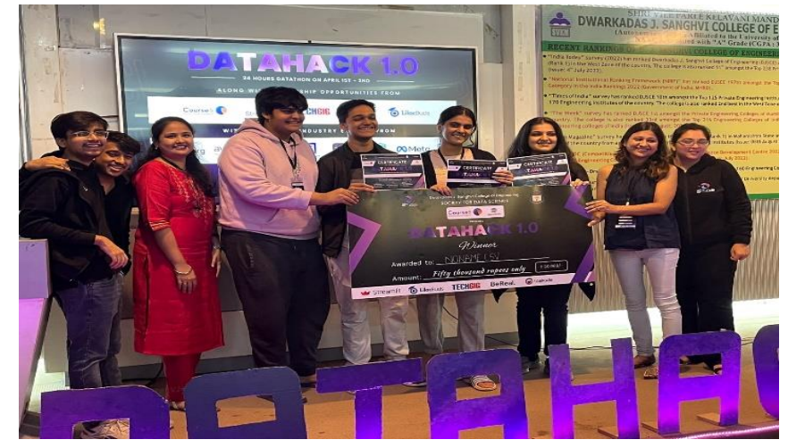
The Datahack organizing Committee with Judges