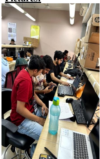
Mentoring Session in progress