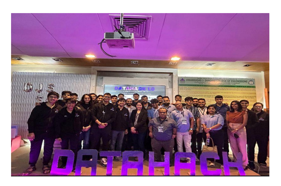
Winners of DataHack